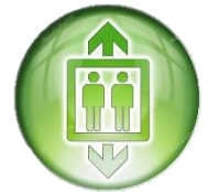
Transport of persons In dynamic mode